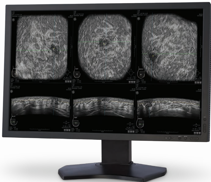
Invenia ABUS Viewer displays 3D volumes in a patented, 2-mm-thick coronal slice.

Invenia ABUS 2.0 uses the powerful cSound™ Imageformer, a software-based graphics processor, that provides a reproducible and operator-independent acquisition method to achieve consistent, high quality results. cSound imaging allows significantly more data to be collected and used to create every image. Traditional hand-held ultrasound parameters such as focal zones and gain are automatically optimized. Because no image manipulation is required, high image quality is consistent from operator to operator with the touch of a button.